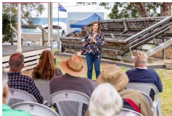
Kristy McBain speaking at the re-opening of the Merimbula Old School Museum