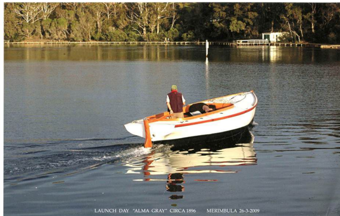
LAUNCH DAY "ALMA GRAY" CIRCA 1896 MERIMBULA 26-3-2009

A main objective of a museum is to tell stories that are significant to a local community. A museum should contain objects that are complete with the stories surrounding them. Museums are also repositories for